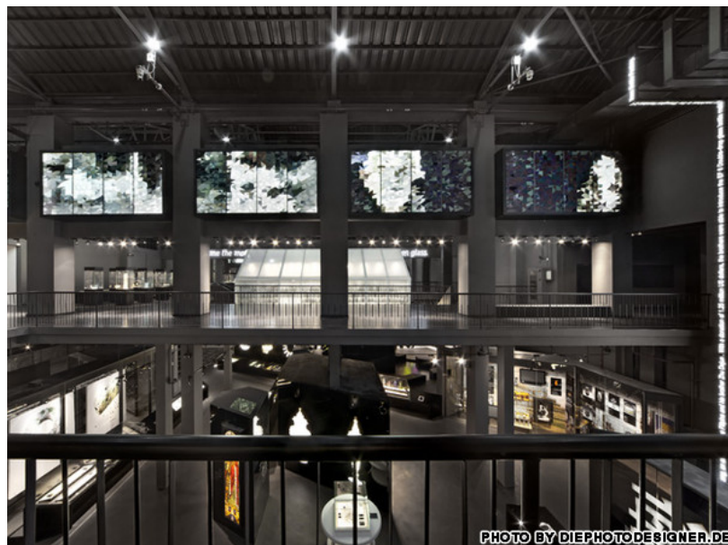
Shanghai Museum of Glass

Our mission is to build a museum that meets international standards, using practical work and imagination, to energize the creative city in this post-industrial era. The wealth of the world comes from cultural diversity, expertise, and from diversification. We have recognized the importance of multi-cultural understanding and communication, from the beginnings of Silk Road. This realization is the key to our success.