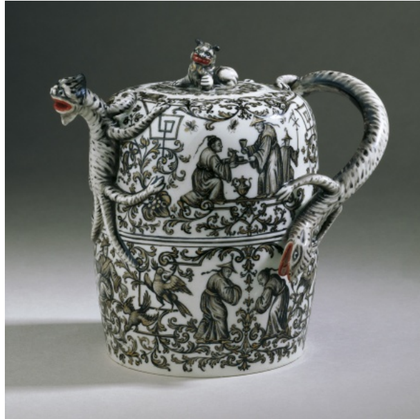
Ignaz Preisler, Teapot with cover, Liechtenstein, The Princely Collections

Best known English glassworks, like Bristol (1760-1780), or Bohemian glassworks, like Ignaz Preissler (1676-1741) or Jiríkovo Údolí (Georgenthal, 1827-1830), or in Spain, like the Royal Glass Factory, to give some examples, all productions reflecting Chinese artistic influences.