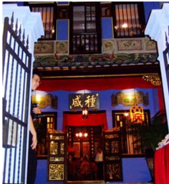
Baba House, Singapore. The plaster relief above the right window shows a folding album with the characters dan gui, referring to the golden Osmanthus which symbolizing prosperity. Above the left window, the characters zi jing refer to the purple Bauhinia which represents harmony among siblings.

The 1st and 2nd floors of NUS Baba House facilitate the understanding and study of early 20th century Peranakan Chinese domestic culture. The building is also an educational resource, providing opportunities for research into conservation methodologies and tropical architectural traditions. The 3rd floor has been converted to an exhibition space enabling academic researchers and art practitioners to present fresh viewpoints on the Peranakan Chinese community, cultural evolution, hybridity and urban developments.