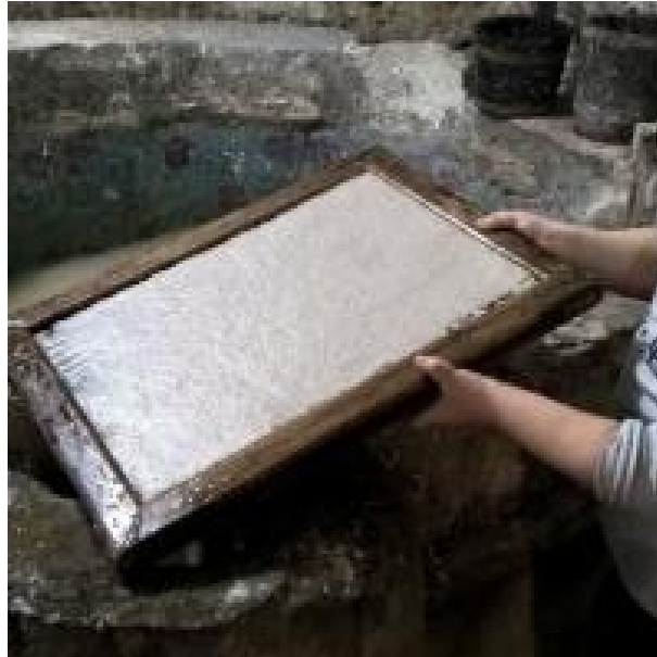
Wooden frame with pulp

a screen made out of reed, bamboo or grass loosely on to the wooden frame. In Fabriano, a deckle was used which allowed couching. This new mould with deckle led to more efficient production since one worker could fill the pulp into the mould while another couched the pulp off on to a felt surface. Meanwhile the first worker could fill a second mould with pulp.