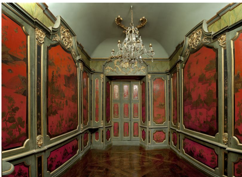
The Piemontese Gabinetto in the Collection of the Nelson-Atkins Museum of Art.

This paper will examine the provenance of the room as associated with an aristocratic Piedmontese family, documentation, original drawings in the Museo Civico in Turin, the transformation and adaptation of the Livre de desseins chinois , the 18th century setting of the room, the survival of the correlating stucco ceiling and technical analysis of the japanned panels. The paper will also put the Gabinetto in context with other surviving gabinetti in Turin and discuss the work of Pietro Massa, the most noted name associated with japanned decoration in Turin, in relation to the Nelson-Atkins Gabinetto .