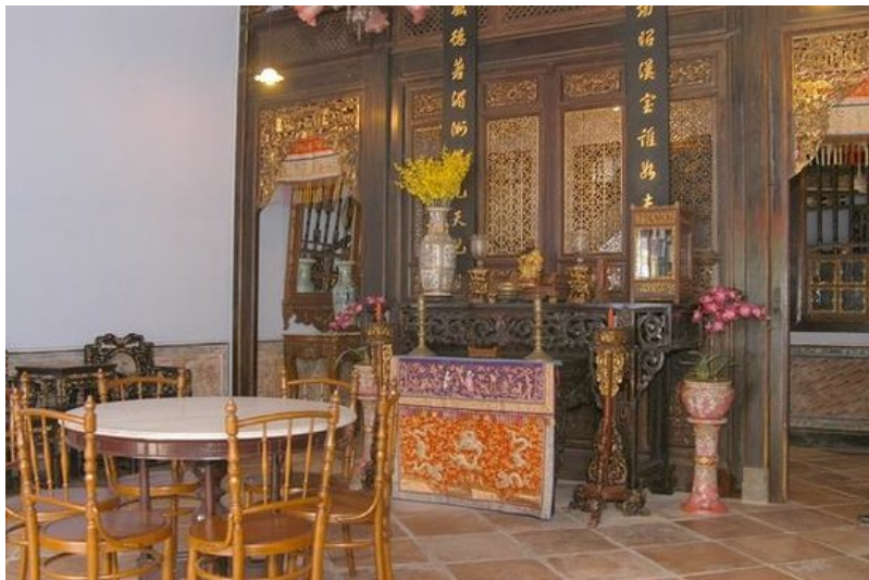
Baba House, Singapore, Front Hall (Reception Hall)