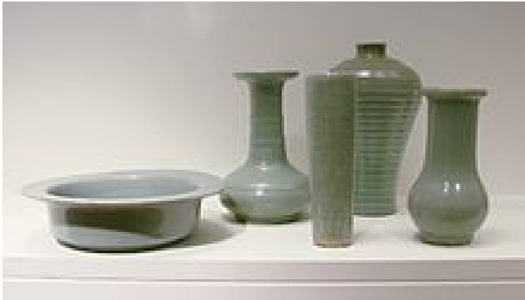
Green Celadons from the Longquan District

Around 1600 the Portuguese lost their European monopoly on the Asian trade and viewed competition from the Dutch and the English. The Dutch East India Company (VOC) in particular shipped huge amounts of porcelain. Soon, pieces made of this new and unknown material from far-away China became highly appreciated exotic elements in the interiors of well-to-do burghers in The Netherlands.