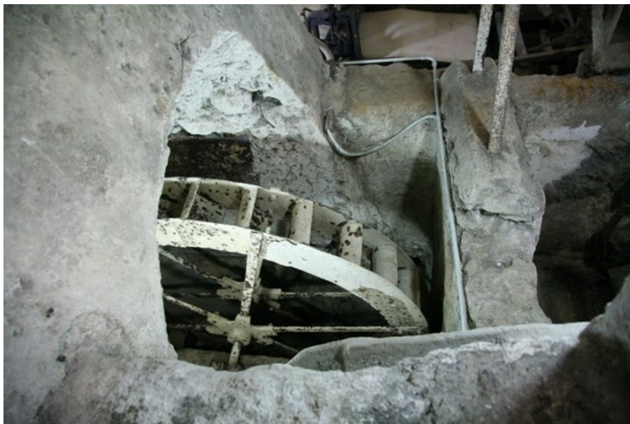
Amalfi, Old paper's mill

The Chinese papermaking technique spread east to Korea and Japan, and west along the Silk Road to Europe. The first European document on paper dates from 1102 written by Count Roger II, who became King of Sicily in 1130. Despite the existence of this evidence, there is no record of paper mills in Sicily. The first European paper mill is reputed to be the one in the Spanish town of Jativa, south of Valencia, which was established in 1151. In Italy there was a famous mill in Amalfi, which probably started production long before the 13th century, but as its archives were destroyed by fire, the exact date is unknown.