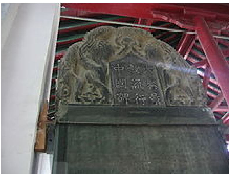
Nestorian Stele of Xi'an, Xi'an, Beilin Museum

In 1625 it was found a monument that celebrates the introduction of Christianity in China during the 7th century. According to the so called Nestorian Stele or Monument of Xi'an, written by Jingjing in 781, a missionary called Alopen was received in the court of the Tang Emperor, Taizong, who ordered the translation of the first Christian texts in Chinese.