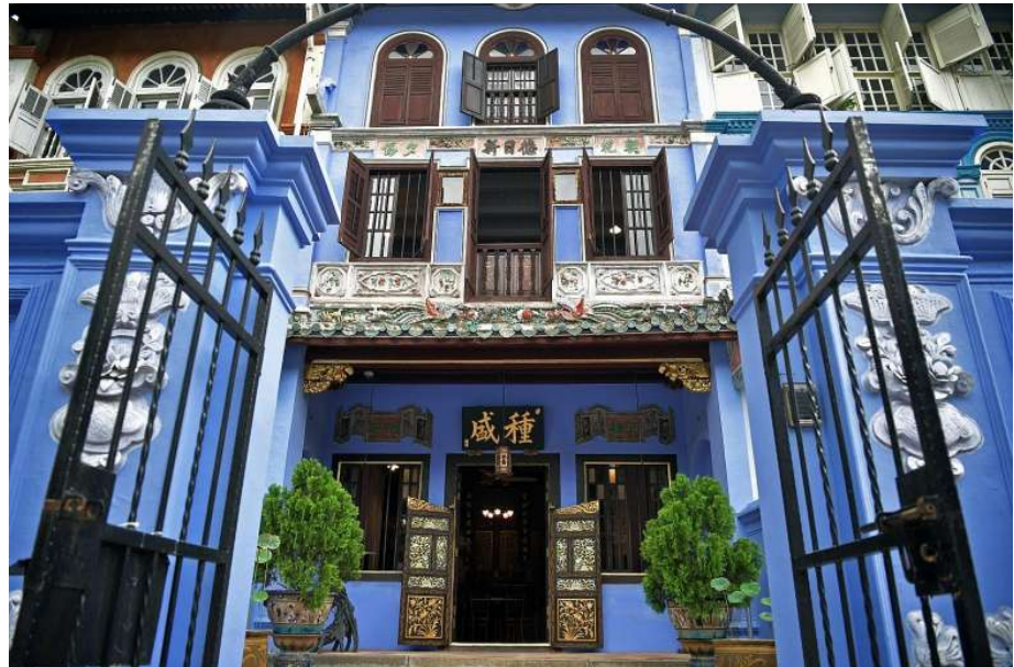
Baba House, Singapore

structures constructed in urban Singapore during the 19th and early 20th centuries - a rowhouse or shophouse sited on a deep, narrow lot with a narrow frontage. 157 Neil Road was originally a two-storied building but a third level was added, probably around 1910 when the Wee family moved in.