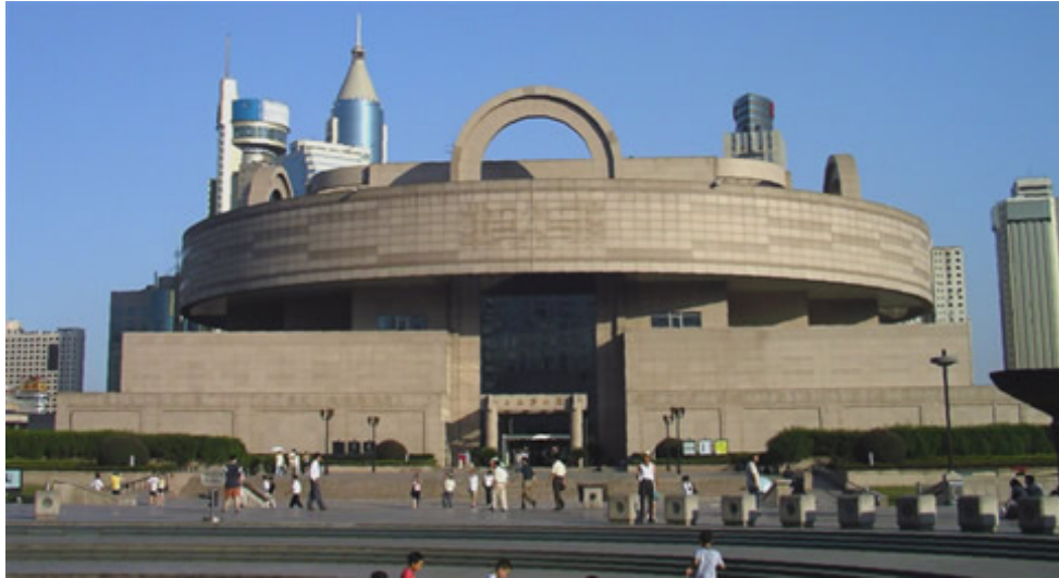
The Shanghai Museum

Morning, lunch and early afternoon visits (not guided) to the Shanghai Museum, Remnin Square, and / or the Shanghai Art Museum, Remnin Park, and / or Shanghai Museum of Contemporary Art, Remnin Park