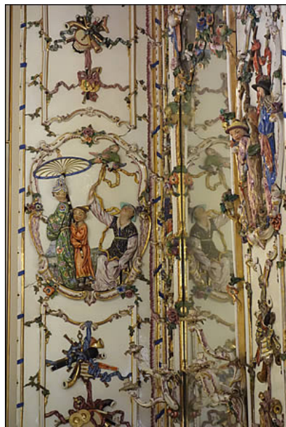
Chinese Saloon, Palazzo di Capodimonte

The dreamlike and fantastical character of Marco Polo's and Odorico da Pordenone's descriptions of Cathay was always in the vision of Venetian artists and decorators of the 18th century, different from Naples, where the influence of the Jesuits' texts and images was much more identifiable.