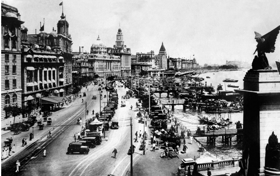
Shanghai, The Bund c.1937