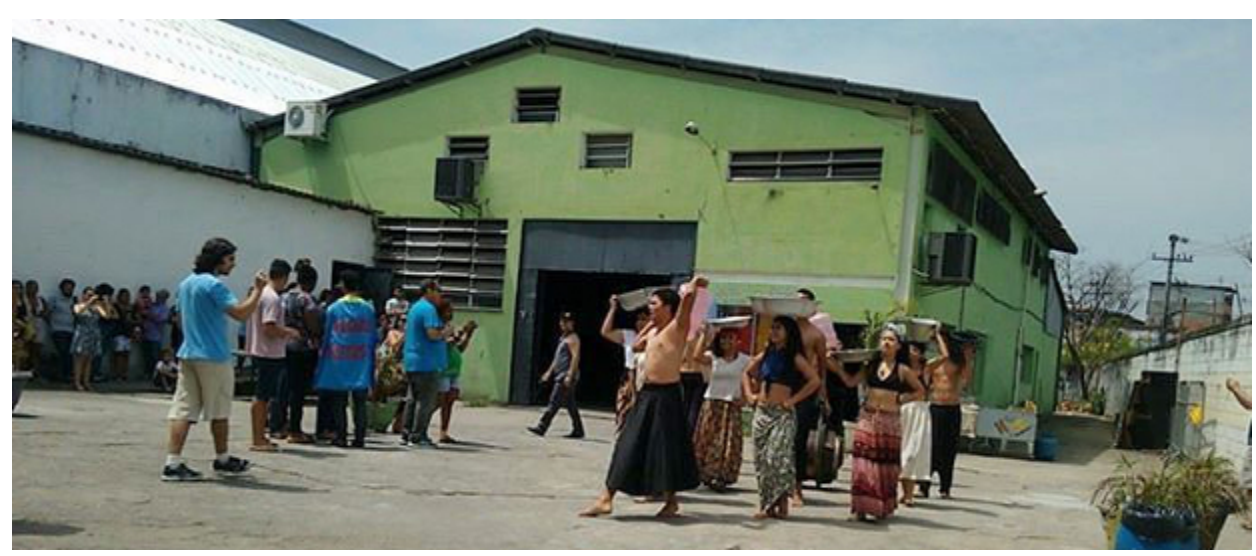
Museu da Maré, Rio de Janeiro

The following two days were spent visiting house museums: the Museu de Maré, in the favela of Maré, inaugurated in 1989 to collect the memories of the local community;