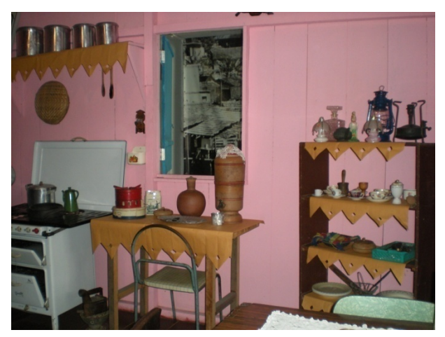
Une des salles du Museu da Maré, Rio de Janeiro.

The Museu do Açude in the Tijuca Forest, renovated in 1920 as a colonial residence by the collector and entrepreneur Castro Maya, who created a remarkable museum which combines artistic and natural heritage, with a collection of Chinese, Indian, and Indo-Chinese sculptures, European and Eastern ceramics, and Brazilian furniture.