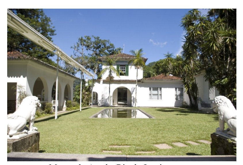
Museu do Açude, Rio de Janeiro

The Museu do Açude in the Tijuca Forest, renovated in 1920 as a colonial residence by the collector and entrepreneur Castro Maya, who created a remarkable museum which combines artistic and natural heritage, with a collection of Chinese, Indian, and Indo-Chinese sculptures, European and Eastern ceramics, and Brazilian furniture.