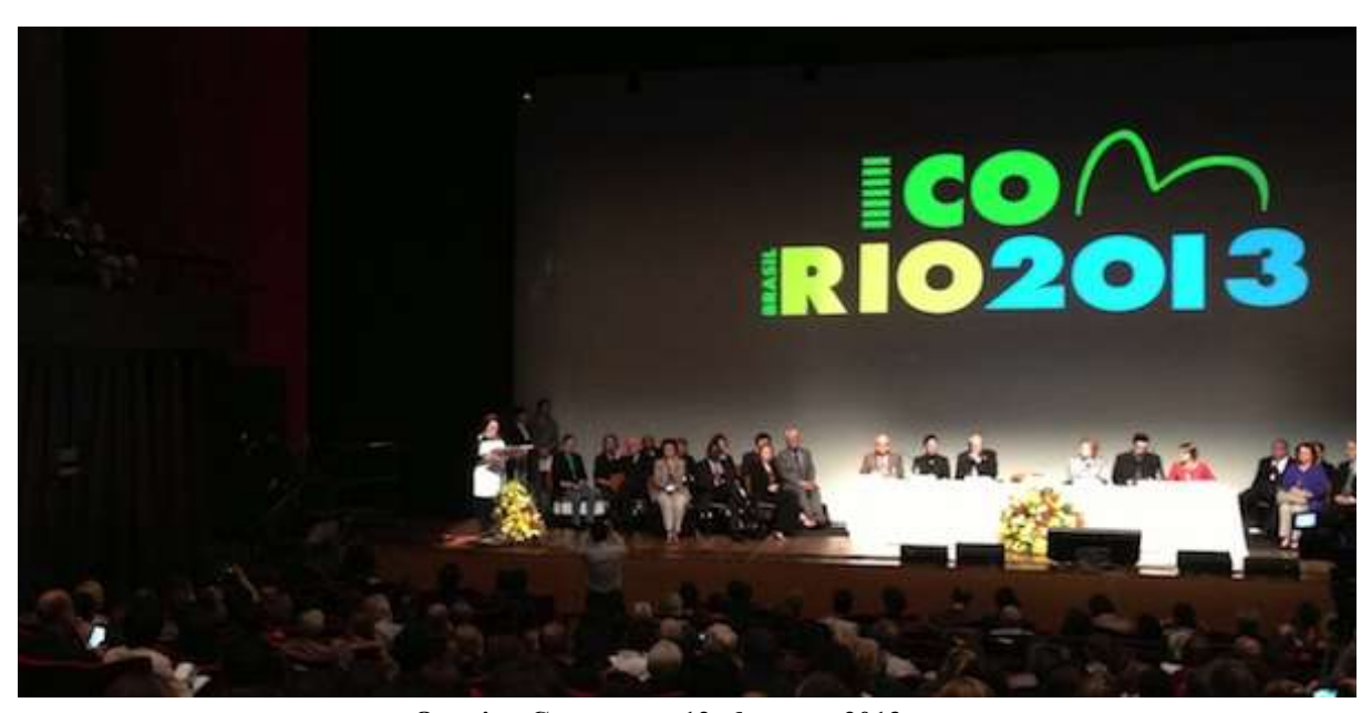
Opening Ceremony, 12nd august 2013